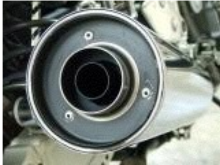
The finished article.

All the bits painted and polished ready to go back in. Good idea to use heatproof paint, I used engine enamel but it bubbled up on the first run. Bugger