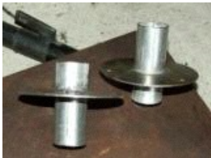
I made these up out of some 32mm pipe and some 2mm flat steel. A press drill and a hole saw were used to get the large hole in the centre.