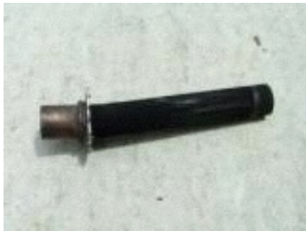
This is what the tube looks like when you rip it out.