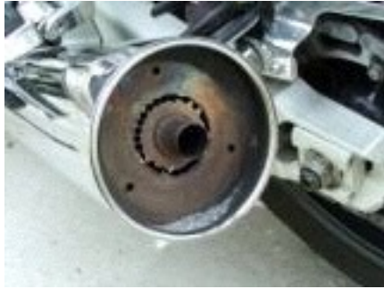
A bit messy but a 5mm drill bit does the job.