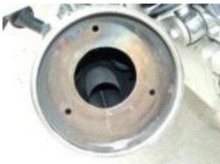
Cleaned out the hole with a grinding bit on the drill.